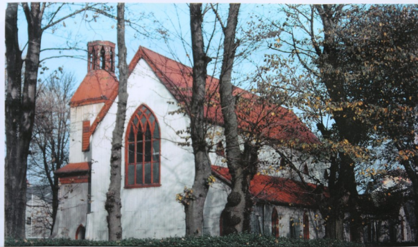
THE OLD 'TIN TAB'

vibe in the area. This was because there were plans to build the 'new' Church to serve the people of Upper Douglas, a project for which the faithful